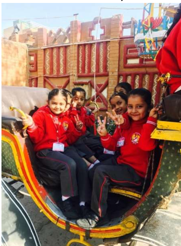
Visit to Nirali Dhani