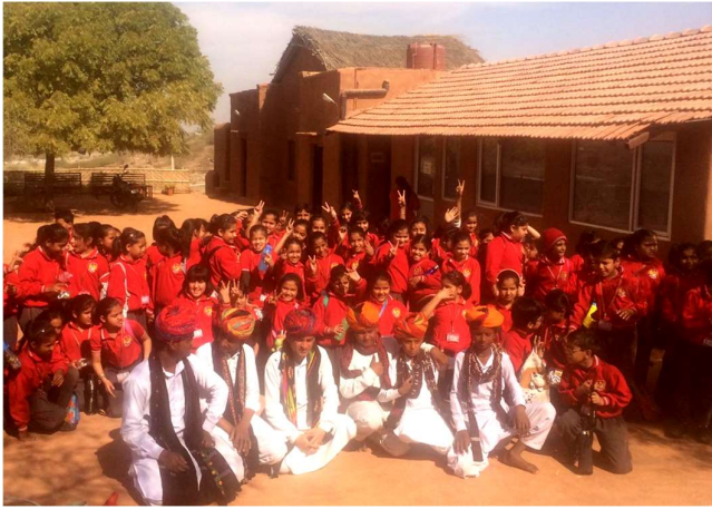
Visit to Arna Jharna