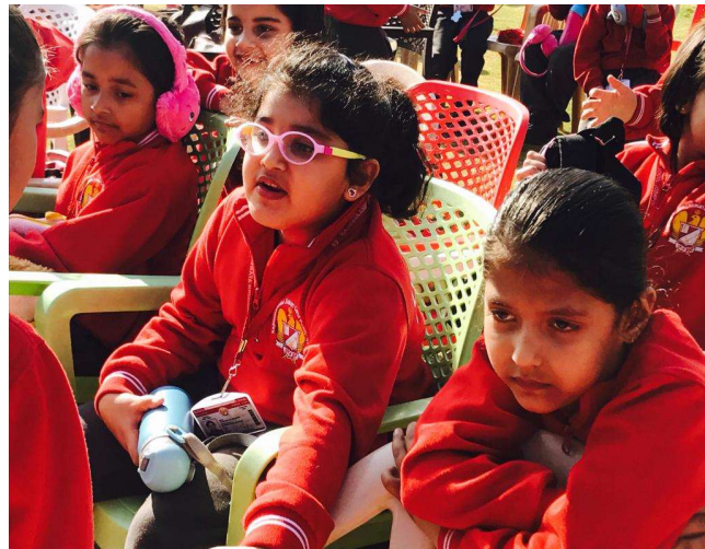
Visit to Nirali Dhani