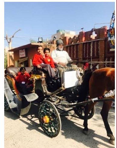
Visit to Nirali Dhani

The students of Primary wing were exposed to experiential learning through interacting. The students visited the Fort, Palace and Jaswant Thada which displays historical grandeur, enjoyed the traditional art forms at Arna Jharna and Nirali Dhani. The visit enabled the students learn through first- hand experience.