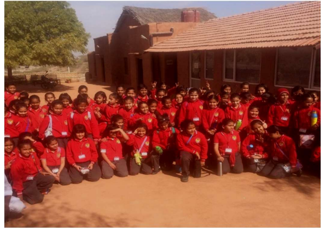
Visit to Arna Jharna