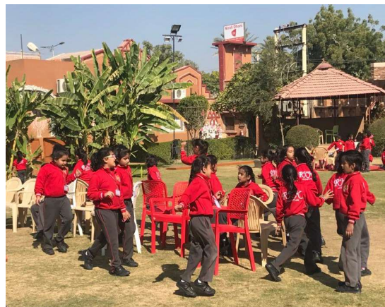
Visit to Nirali Dhani