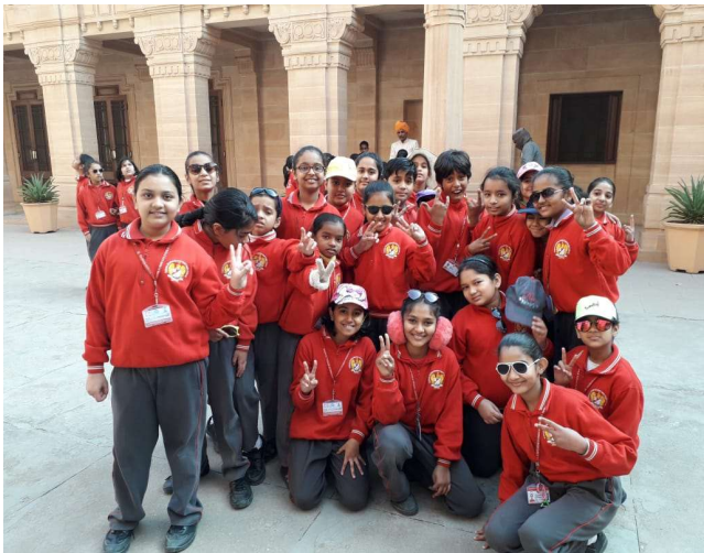
Visit to Palace, Fort and Jaswant Thada